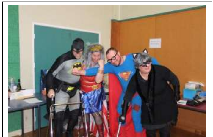
The Super Olds